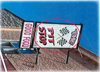
Remove the (2) existing faces of top sign and scrap

GRAPHICS : Digitally printed on translucent vinyl to match graphic, all applied first surface