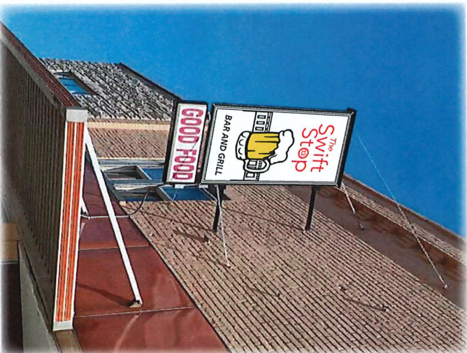
New faces installed in existing sign cabinet on both sides